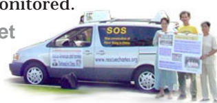
Cross-Country Rescue Tour