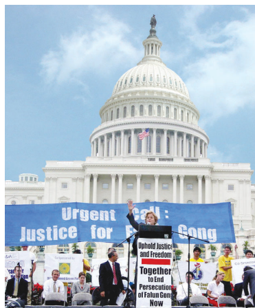
Washington, D.C., rally: "Together to end the persecution of Falun Gong Now"

H. Con. Res. 188 , passed by unanimous vote in July 2002, calls on China to release detained practitioners, cease the use of torture, and abide by the International Covenant on Civil and Political Rights as well as the Universal Declaration of Human Rights. It also states that the U.S. Government should investigate illegal activities perpetrated by Chinese officials and agents against Falun Gong in the U.S.